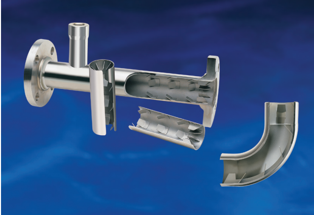
Figure 2. Vortab inline and elbow flow conditioners help eliminate upstream straight run requirements for pumps and other process equipment.

By Jim DeLee, Sr Member Technical Staff Fluid Components International